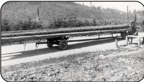
Henry Isackson hauls telephone light poles.

2011 - Redmond City Hall installs two car charging stations.