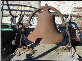
The bell on its way to Artech.