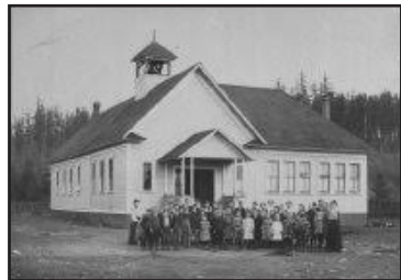
Possible location of school bell atop the Congregational Church.

We have just signed an agreement to receive the bell from the City of Redmond along with a grant for restoration. We are now planning for the restoration, fabrication of a pedestal, and moving and displaying the bell in the hallway outside our office/museum.