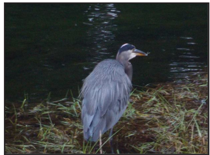
Great Blue Heron, Sammamish River, Redmond, WA.

Looking forward to seeing you on January 14, 2023 at the Happy Valley Grange for our 2023 Membership Social! Bring along a friend or two and introduce them to all Redmond Historical Society has to offer!