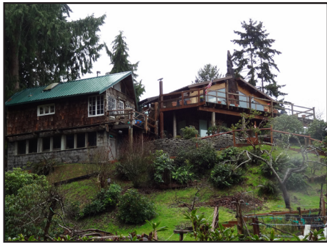
(L-R) Dudley Carter in front of the Haida House before it was moved to Whidbey Island; the Haida House on Whidbey: view from the garden below, potting shed on the left. (Below) Entrance to the Haida House and yard; view from Haida House and deck, zoomed in.