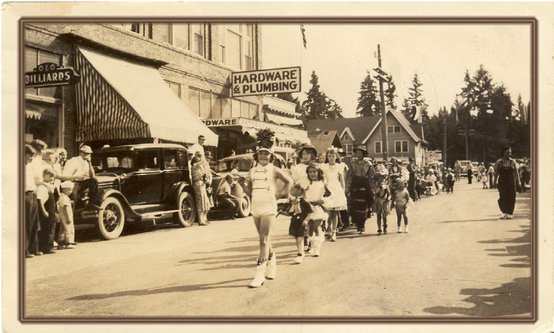
“Children’s parade” on Leary, ca. 1946.

We’ll miss seeing you at Saturday Market and Derby Days this year. Stay tuned for updates on the “soft opening” of our office at the Old Redmond Schoolhouse. Meanwhile, visit our Facebook page, and check our website for upcoming events—including our summer walking tours of Redmond’s historic downtown. For details and to register, see p. 7. Our next issue of this newsletter will be the Special Summer Edition in August.