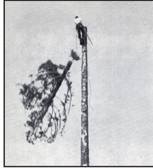
Spar rigger.