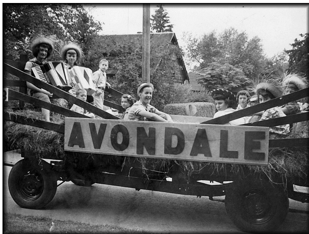
Avondale Derby Float at the 1954 Derby Days Parade.

Join the Redmond Historical Society this summer! Our office is open for scheduled visits and museum tours. We'll see you at Saturday Market, Derby Days, or one of our Walking Tours! See pages 4 and 7.